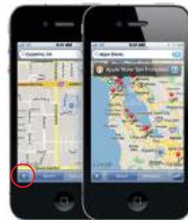
Google, the Google logo, and Google Maps are trademarks of Google Inc. © 2011. All rights reserved.